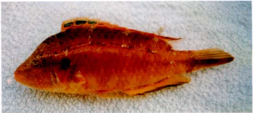
Fig. 2. - Specimen of Pteragogus pelycus , 58.1 mm SL, captured off Rhodes on 18 October 1994.