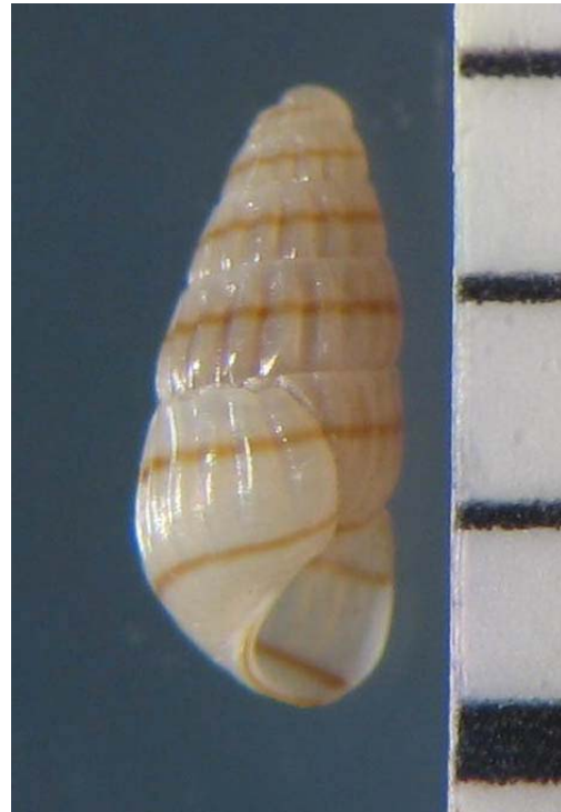
Figure 2. Chrysallida fischeri from Makri islet (W Rhodes, S Aegean Sea). Size: 2.7x1.13 mm

Our shells have 6-7 whorls and measure approximately 1.6-2.7 mm in length and 0.76-1.13 mm in width. Their color is white or creamy with yellow or brown stripes parallel to the whorls (Figure 2).